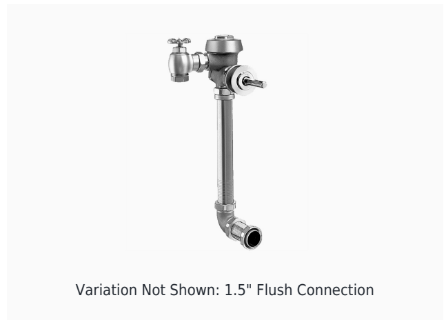
Variation Not Shown: 1.5" Flush Connection